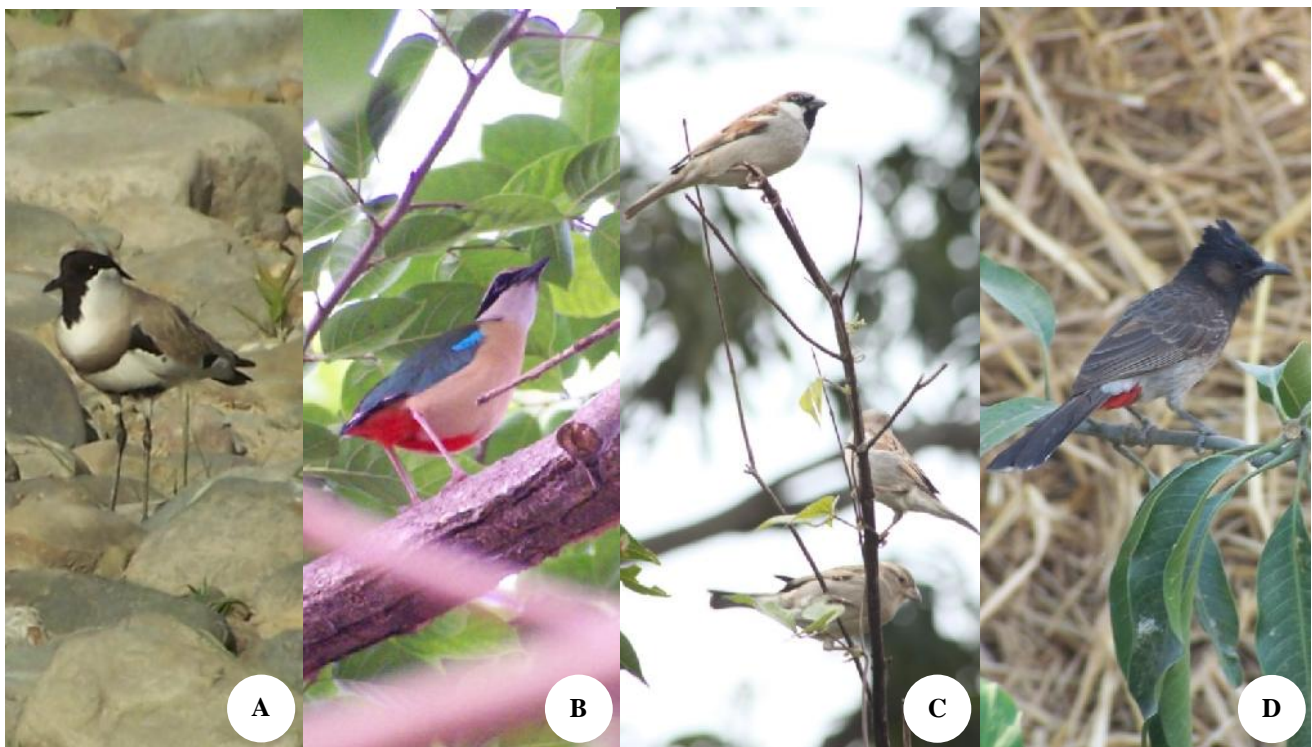
Figure 3. Some birds of Lansdowne forest division and adjacent suburban landscapes, Garhwal Himalayas, Uttarakhand, India. A. River Lapwing (near threatened avian species), B. Indian Pitta (forest bird), C. House Sparrow (suburban bird), D. Red-vented Bulbul (common to suburban and forest habitats)

areas) than between site B and site A (0.63 for suburban and 0.41 for forest) or between site C and site B (0.57 for suburban and 0.41 for forest). Photographs of a near threatened and three selected exemplary bird species representing forest area, suburban habitat and common habitat have been appended as Figures 3.A to 3.D.