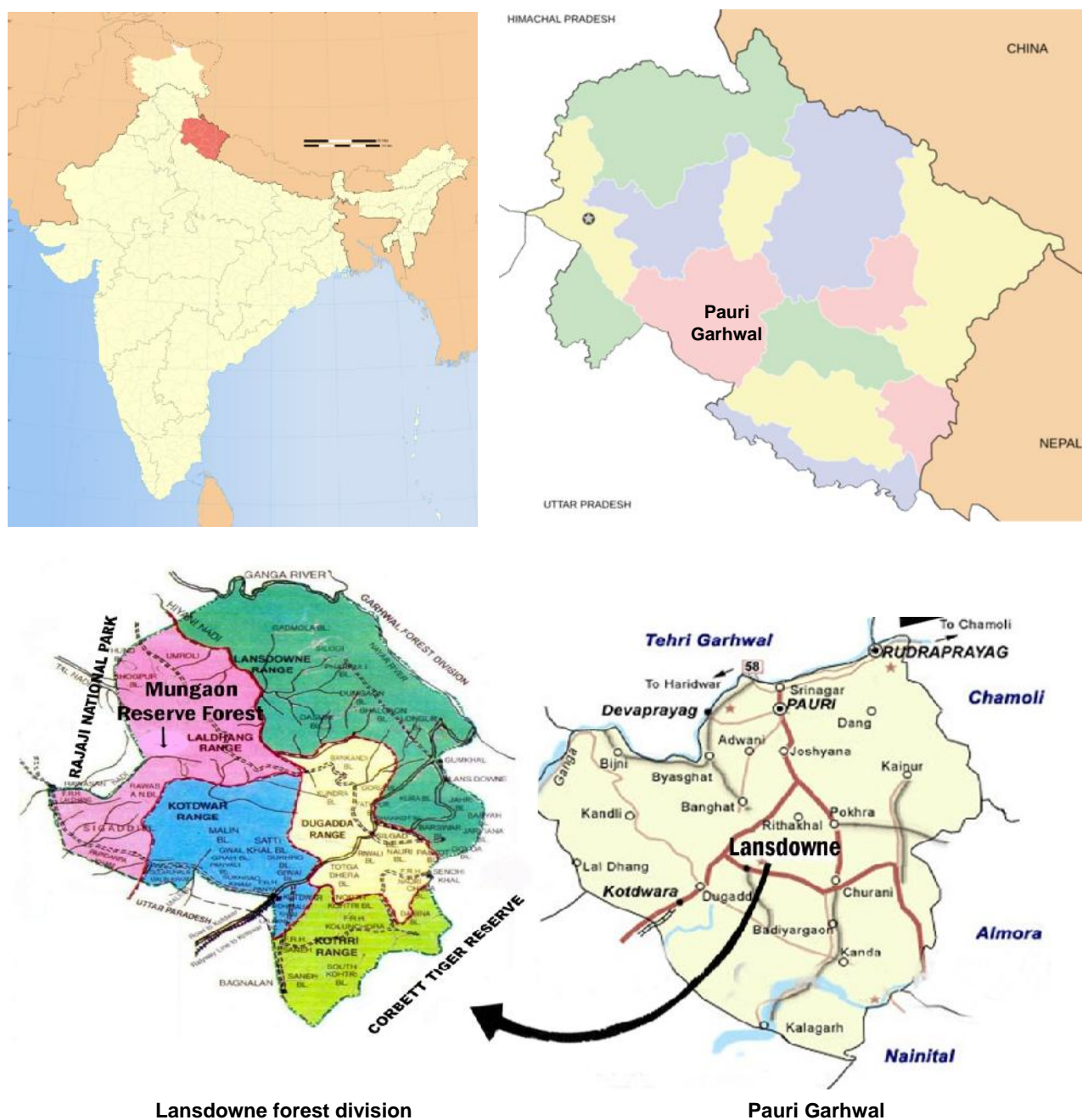
Figure 1. Showing location of Lansdowne forest division, Pauri Garhwal district in Uttarakhand, India.

can be divided into three distinct seasons viz., rainy season (July to October), winter (November to February), summer (March to June).